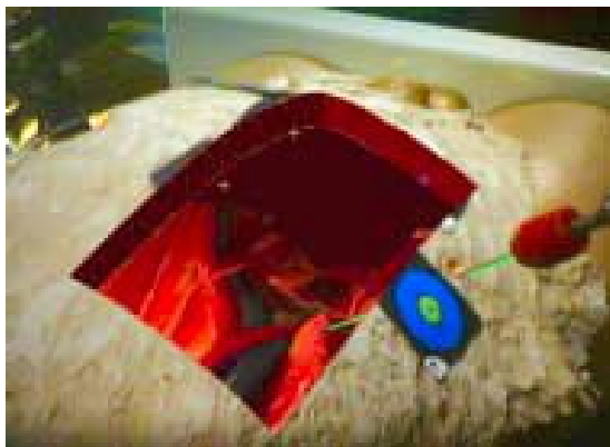
Figure 3: AR-supported surgery. The surgeon is given the impression of "seeing inside" their patient.

For instance, there are many examples of medical research 11, 12, 13 that utilises AR technology to assimilate information from technologies such as ultrasound scanning and presents it to the surgeon in such a manner that it appears as though they can "see inside" their patient as they perform the operation, even during procedures such as biopsies and keyhole surgery where such visibility is not possible.