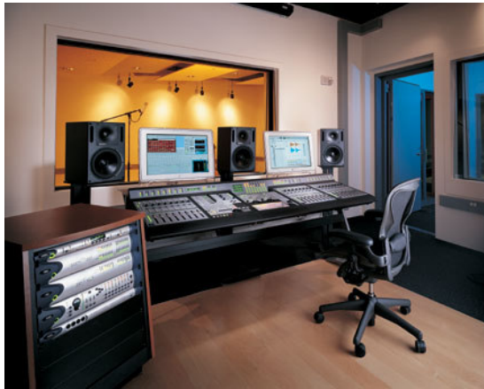
Figure 4: A typical recording studio configuration provides a good example of an effective mixed distance user interface.

Such mixed-distance interfaces are a sensible approach to improving directness, as they allow a commonly used subset of tasks or operations to have a lessened cognitive distance without sacrificing the flexibility of a more traditional user interface for the less common tasks.